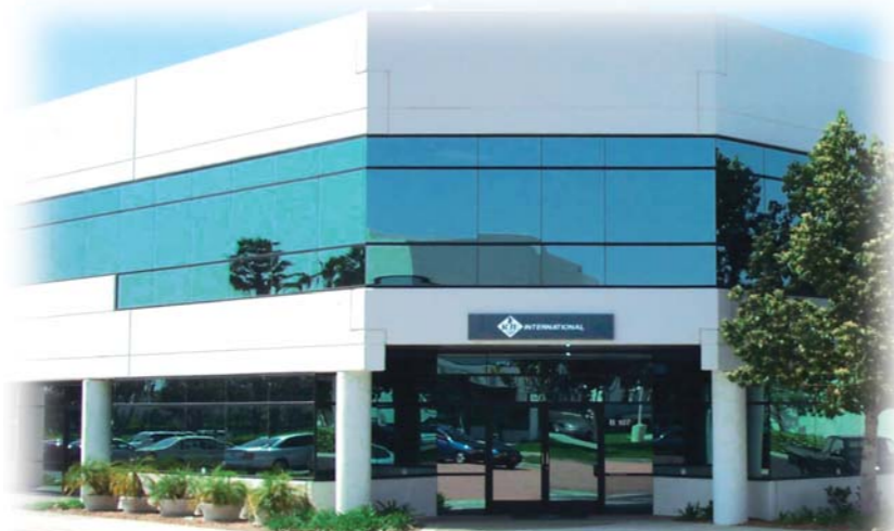
SonarGuard® was developed by RJE Technologies, Inc., headquartered in Irvine, California

Please use our dealer locator on our website to find a dealer near you.